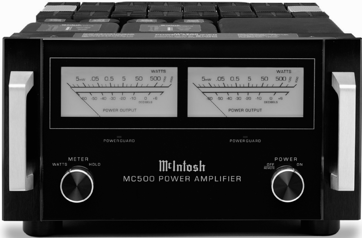
MC 500 POWER AMPLIFIER