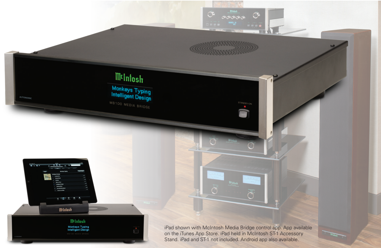
iPad shown with McIntosh Media Bridge control app. App available on the iTunes App Store. iPad held in McIntosh ST-1 Accessory Stand. iPad and ST-1 not included. Android app also available.