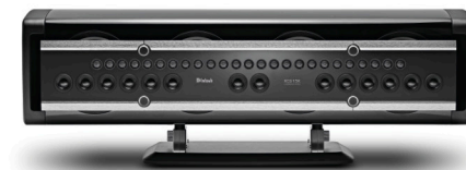
XCS1.5K Center Channel Loudspeaker