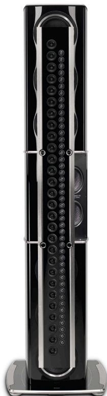
XRT2.1K Floorstanding Loudspeaker