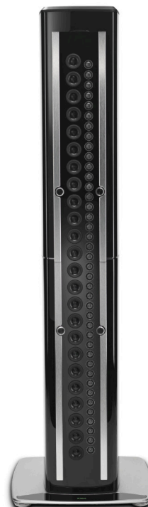
XRT1.1K Floorstanding Loudspeaker