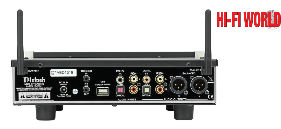
The MB50 has two attenae for a secure wi-fi connection plus balanced and unbalanced analogue outputs as well as a full range of digital in and out connections.

The MB50's streaming capabilities are provided via the Play-Fi system developed by DTS – the American company better known for its