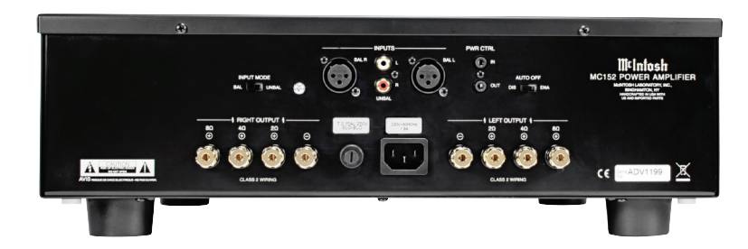
Both balanced XLR and unbalanced RCA inputs are provided, as well as taps for 2, 6 and 8 Ohm loudspeakers.

That's because this new McIntosh power amplifier is a very impressive piece of equipment in its own right. It may be the smallest of the company's range of power amplifiers (both in terms of physical size and power output) but it still packs a significant punch — combining a big, punchy sound with a liquid, thoroughly