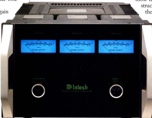
The massive McIntosh MC303 with its pretty blue power level meters.

The McIntosh MC303 ($10,000) is an impressively large, heavy power amp rated at 300Wpc with an output-current capability of 60 amps. McIntosh states that this, along with its more than 200 joules of energy storage, empowers the MC303 to pump out up to 1200Wpc on music bursts, regardless of speaker load. One reason is McIntosh's employment of their proprietary output autoformers to optimize power transfer for 2, 4, or 8 ohm speakers.