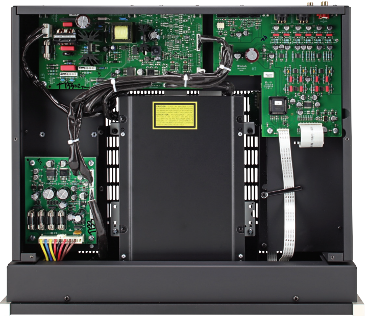
The disc transport takes up much of the MCD350's top space, and it is surrounded by power and control boards. Note the many fuses at bottom left. Signal processing boards sit in a lower chamber.

is a top-quality SACD player and a good CD player too. It's expensive but if interested I suggest you go for a demo. since its sound won us over.